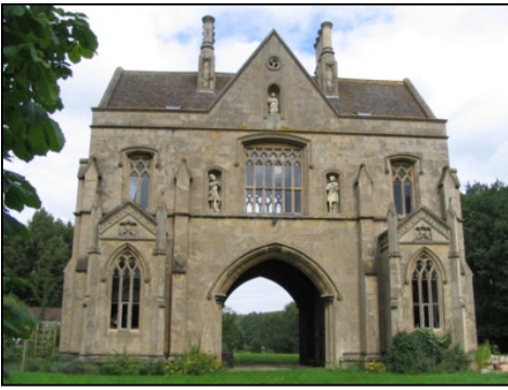
Archway Lodge site 11